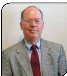
Lynn Powell Hotels